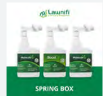
Lawnifi Spring Fertilizer Box